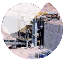
Mining Systems & Equipment