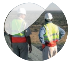
Services & Components