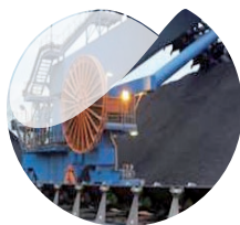
Bulk Material Handling